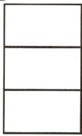
Make fabric swatches

I would suggest that after you make you fabric swatch, that you color your pattern with your fabric colors. This will make it easier to assemble the blocks. All Seams are pressed open.